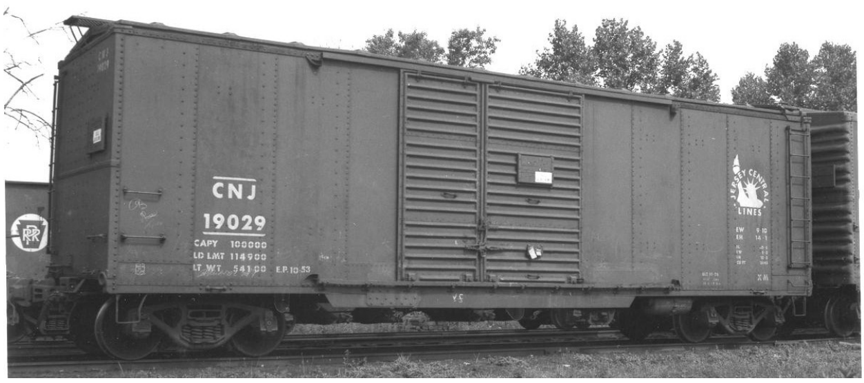
CNJ 19029 circa 1955. Location unknown.