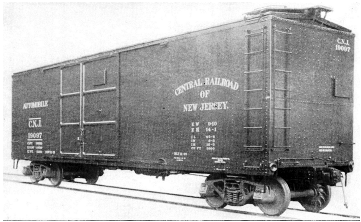
CNJ 19097 ACF builders photo December 1926.

Following the lead of most of its competitor railroads, the Central Railroad of New Jersey (CNJ) began buying groups of all steel cars during the 1920s. The purpose was two-fold: to replace the outdated wooden cars that were being retired and to expand their fleet to accommodate the increased industrial traffic of the period. One of those groups consisted of 200 (numbered 19000-19199) cars built by AC&F in 1926 with a 10' inside height and a 10' door opening. These cars were for automobile loading and classified XA. The cars were originally equipped with plate steel ends, 1 ½ Creco three-panel steel doors, Hutchins Dry Lading steel roofs, wood running boards, 7-rung ladders, Ajax hand brakes, Dalman two level trucks (some with Scullin side frames and some with ACF standard side frames), and KC-schedule air brakes. The car's dimensions of 40' 6" inside length, 9' 0" inside width, and the aforementioned 10' 0" inside height created a capacity of 3,645 cubic feet. The trucks were rated at 100,000 pounds. The cars were initially painted the CNJ's version of boxcar red with white lettering.