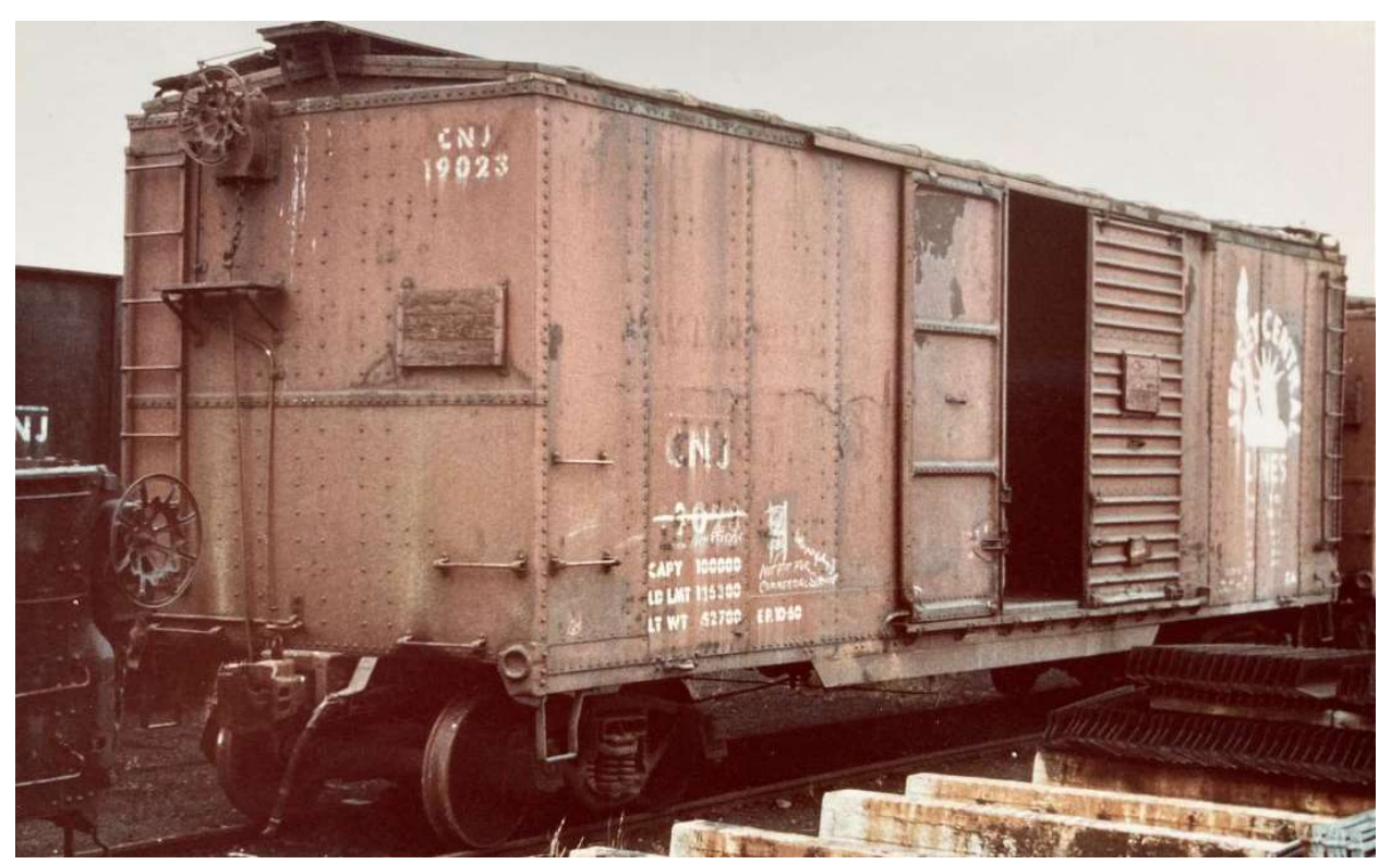
CNJ 19023 circa early 1960s. Note lined out number indicating no longer in revenue service, and original half door.