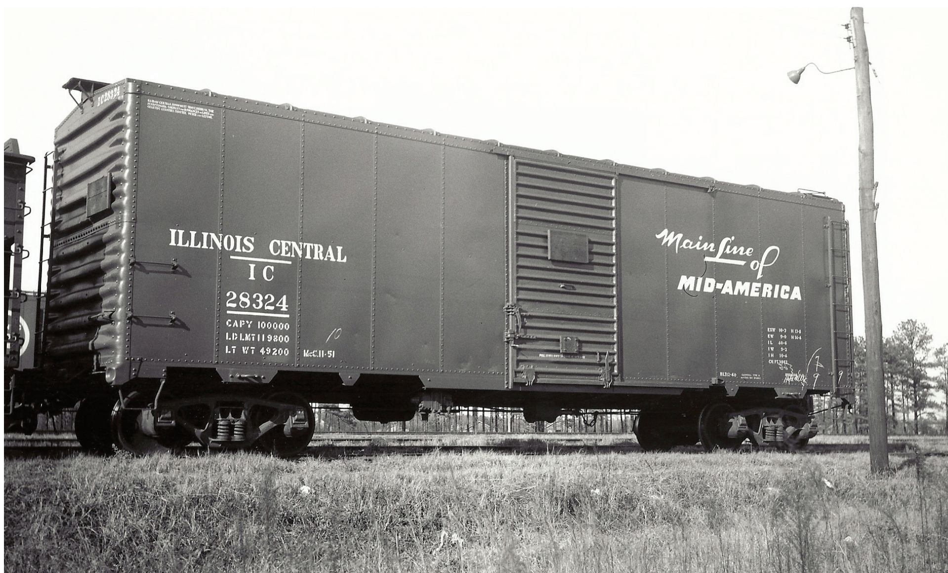
IC 28324 Blt. 12-40 Reweigh/Repaint McComb, MS 11-51

This photo is of a similar car with "W" corner ends. It's included here because it clearly illustrates the "Main Line of Mid-America" paint scheme.