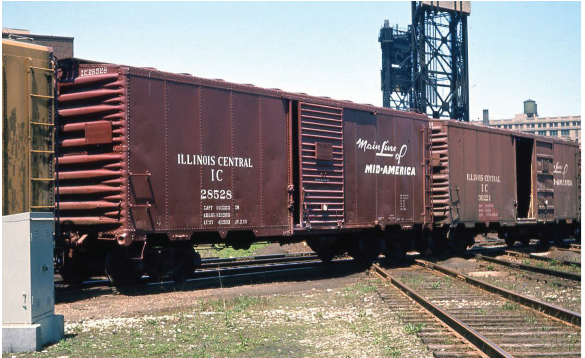
IC 28324 Blt. 12-40 Reweigh/Repaint JT. 3-65

This photo is of a similar car with “W” corner post (rounded) ends. It’s included here because it clearly illustrates the “Main Line of Mid-America” paint scheme in color.